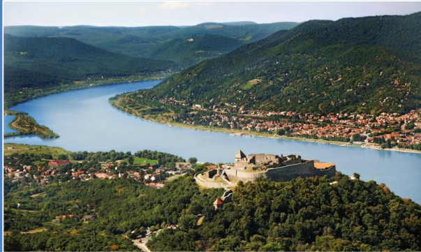
Visegrad & Szentendre Tour